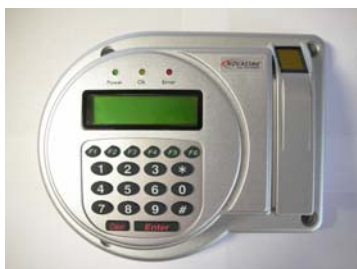
Finger Touch Bio-Metric