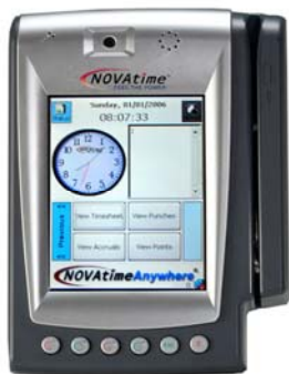
Badge/ Employee Kiosk